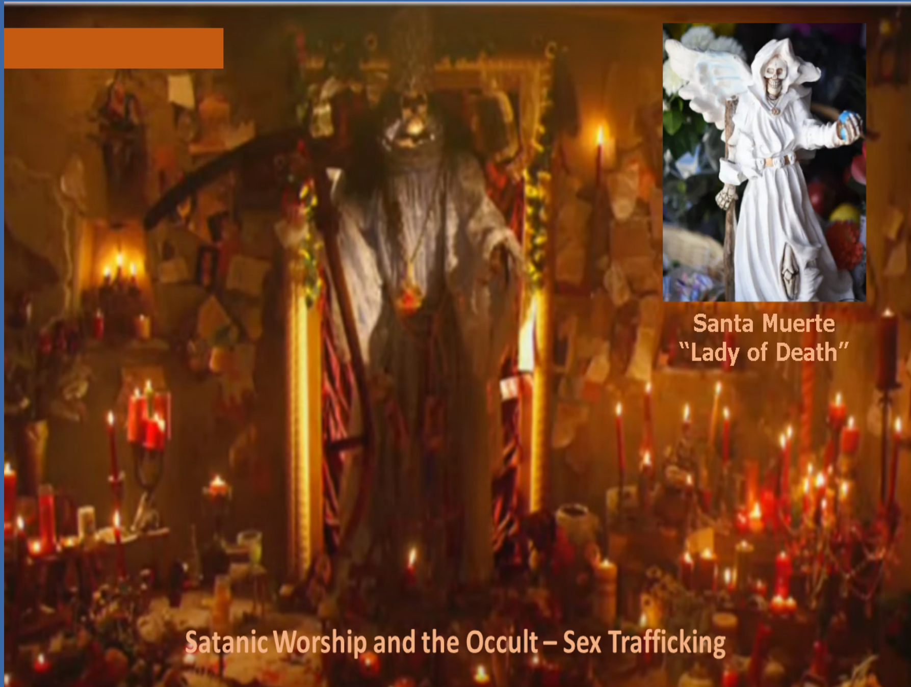
Santa Muerte "Lady of Death"

Satanic Worship and the Occult – Sex Trafficking