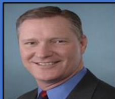
Steve Stivers OH-15 – 49%