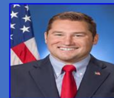
Guy Reschenthaler PA-14 – 52%