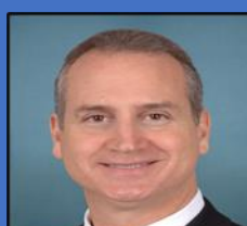
Mario Diaz-Balart FL-25 – 39%