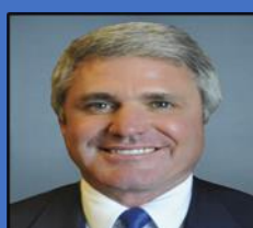
Michael McCaul TX-10 – 41%