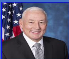
Greg Pence IN-6 – 55%