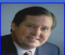
Ken Calvert CA-42 – 52%