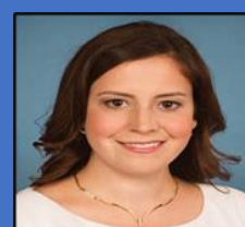
Elise Stefanik NY-21 – 34%