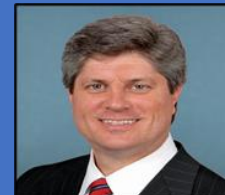
Jeff Lane Fortenberry NE-1 – 44%