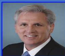
Kevin McCarthy CA-23 – 55%