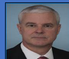
Steve Womack AR-3 – 50%