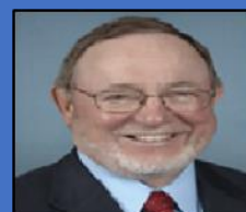
Don Young AK – 50%