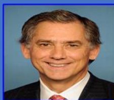
French Hill AR-2 – 55%