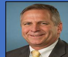
Mike Bost IL-12 – 42%