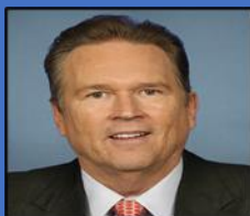
Vern Buchanan FL-16 – 49%