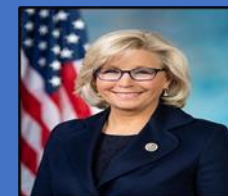
Liz Cheney WY – 50%