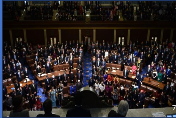
U.S. House of Representatives

The United States House of Representatives is the “lower house” of the United States Congress; the Senate is the “upper house.”