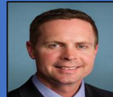
Rodney Davis IL-13 – 44%