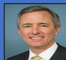
John Katko NY-24 – 32%