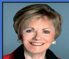
Kay Granger TX-12 – 44%