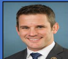
Adam Kinzinger IL-16 – 49%