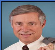
Fred Upton MI-6 – 41%