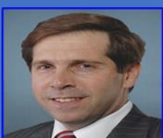
Chuck J. Fleischmann TN-3 – 52%