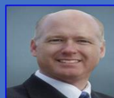
Robert Aderholt AL-4 – 52%