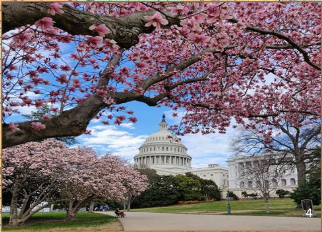
United States Senate