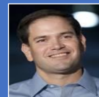
Marco Rubio – FL 68%