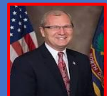
Kevin Cramer – ND 37%