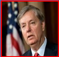
Lindsey Graham - SC 40%