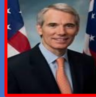
Rob Portman - OH 39%