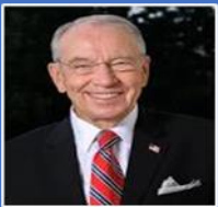
Chuck Grassley - IA 59%

Alphabetic Order in each Non-endorsed (F) Grade Group