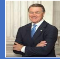
David Perdue – GA 55%