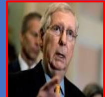
Mitch McConnell - KY 41%