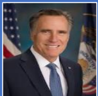
Mitt Romney- UT 54%