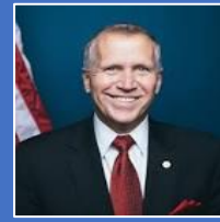
Thom Tillis - NC 56%