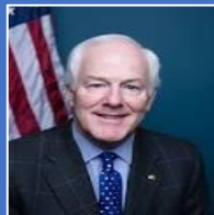
John Cornyn – TX 56%