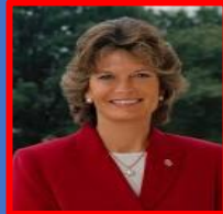
Lisa Murkowski - AK 31%