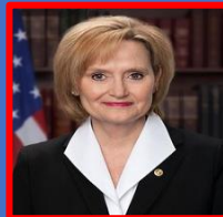
Cindy Hyde-Smith - MS 37%