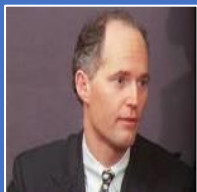
Rick Scott – FL 62%