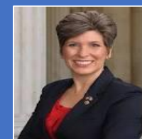
Joni Ernst– IA 58%